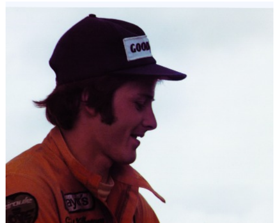
Gilles Villeneuve at Gimli in 1976