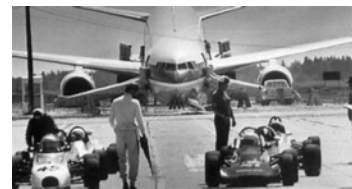
GIMLI GLIDER 1983

GRASSROOTS RACING AT NORTH AMERICA'S MOST FAMOUS ROAD RACE CIRCUIT